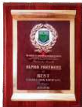
ICAN Best Training Consultant Award 2008