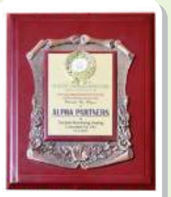
ICAN Best Performing Training Consultant Award 2017