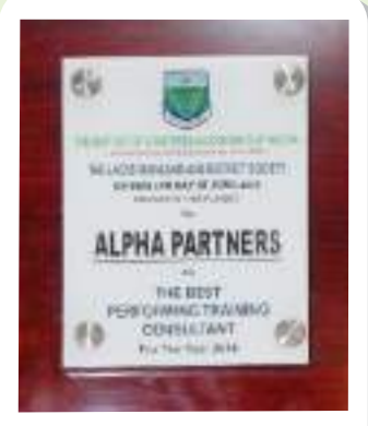
ICAN Best Performing Training Consultant Award 2016