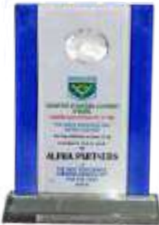
ICAN Best Performing Training Consultant Award 2015