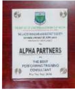
ICAN Best Performing Training Consultant Award 2016