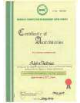
Certificate of Accreditation NCMD