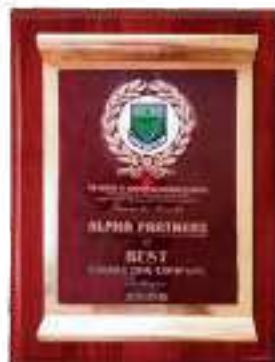
ICAN Best Training Consultant Award 2008