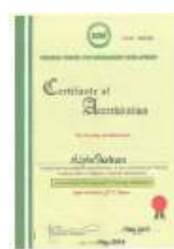
Certificate of Accreditation NCMD