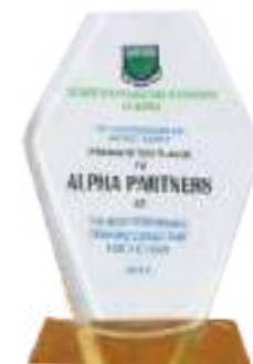
ICAN Best Performing Training Consultant Award 2014