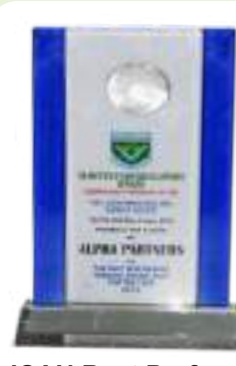
ICAN Best Performing Training Consultant Award 2015