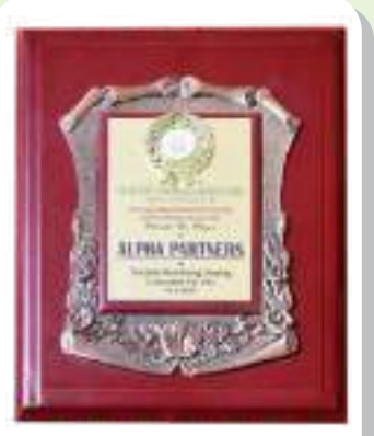
ICAN Best Performing Training Consultant Award 2017