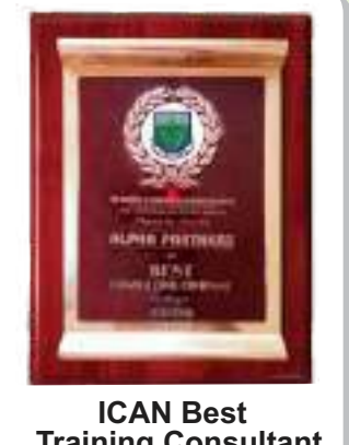
Training Consultant Award 2008