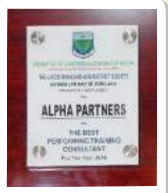
ICAN Best Performing Training Consultant Award 2016