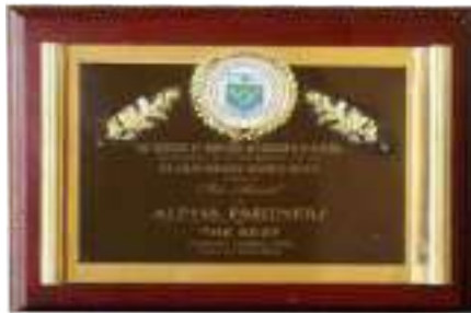
ICAN Best Performing Training Consultant Award 2010