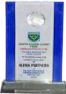
ICAN Best Performing Training Consultant Award 2015