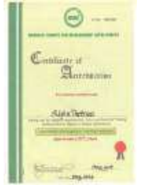
Certificate of Accreditation NCMD