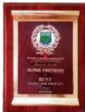
ICAN Best Training Consultant Award 2008