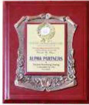
ICAN Best Performing Training Consultant Award 2017