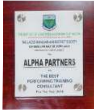
ICAN Best Performing Training Consultant Award 2016