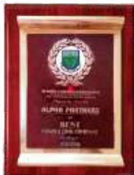
ICAN Best Training Consultant Award 2008