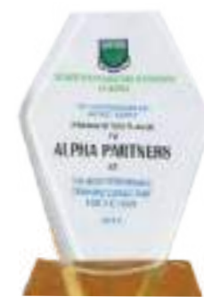
ICAN Best Performing Training Consultant Award 2014