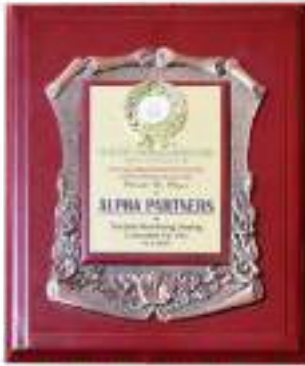
ICAN Best Performing Training Consultant Award 2017