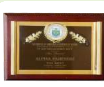
ICAN Best Performing Training Consultant Award 2010