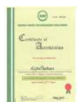
Certificate of Accreditation NCMD