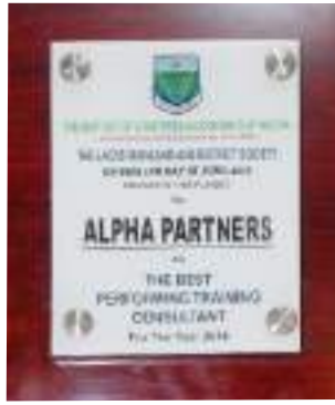
ICAN Best Performing Training Consultant Award 2016