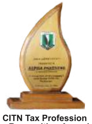
Recognition A ward 2002