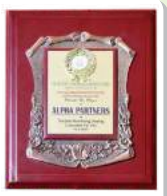
ICAN Best Performing Training Consultant Award 2017